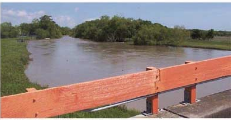
The Guadalupe River as it meanders to the sea Jake Benates

Ostensibly the TNRCC and the Texas Parks and Wildlife Department are supposed to ensure that the bays and estuaries get enough fresh water. Since 1985 the TNRCC has been required to consider instream flows and environmental needs when it looks at new permit applications. Both agencies